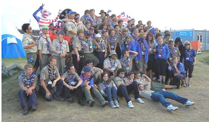
NCAC contingent at the World jamboree. See story on page 10.